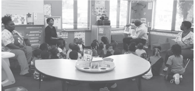
United States Attorney's Office representatives read to the children one hour a month (ALPI Garden Terrace Head Start Center)