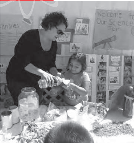
Parents and children conduct experiments at the ALPI Child Development & Family Services Center in Port St. Lucie, FL

It was a science round-up with lots of fun experiments for children. Great Job Center Staff!