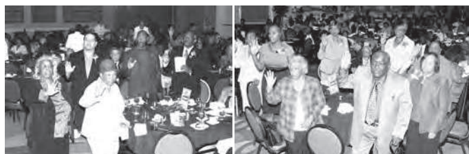
Installation of 2013 ALPI Board Members