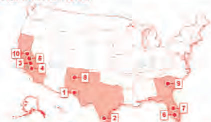
POVERTY GRIPS THE SUBURBS

A record 15.4 million suburban residents lived below the poverty line last year, up 11.5% from the year before, according to a Brookings Institution analysis of Census data. Nearly three-quarters of suburban nonprofit agencies have reported seeing more clients who had never accessed aid before. The 2010 U.S. Census reported the Florida poverty rate at 15 percent and Miami-Dade County poverty rate at 17.7 percent. According to a CNN Money.com article, "Poverty Pervades the Suburbs," poverty in Florida spikes the nation's poverty rate and is now at the highest level since 1994.