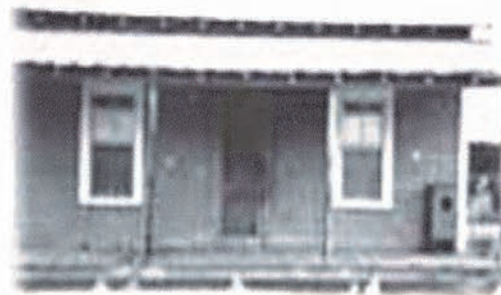
ALPI's 1st Intake Ctr—1968 St. Lucie County, Florida

In the years since its inception, The Agricultural and Labor Program, Inc. has continued to grow and to expand efforts to assist those persons that the organization was chartered to serve. This effort is continuous and will exist as long as there are persons needing services.