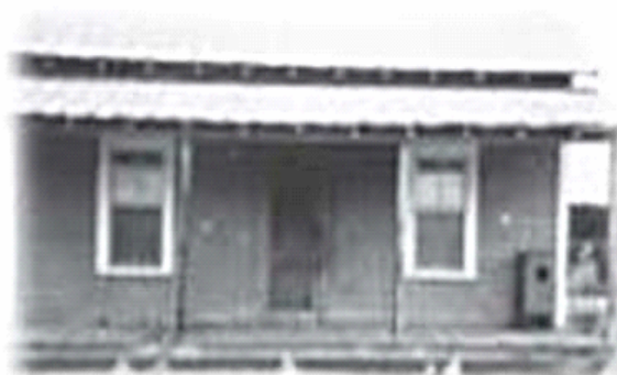
ALPI's First Intake Center St. Lucie County, Florida - 1968

In the years since its inception, The Agricultural and Labor Program, Inc. has continued to grow and to expand efforts to assist those persons that the organization was chartered to serve. This effort is continuous and will exist as long as there are persons needing services.